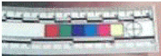
FIGURE 1. Color Scale and Rules

Averages: Red = 141 Green = 120 Blue = 110 Total pixels = 5850 Number different colors = 3366 Ratio of Number of colors to Total Number of pixels = .575