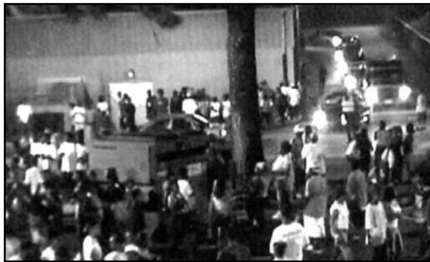
The sheer number of youth hanging out, such as around this roller skating rink, can generate public concern.