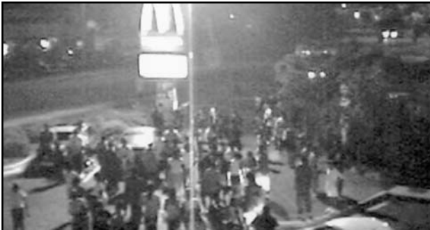
Fast-food restaurants are popular locations for youth to hang out.