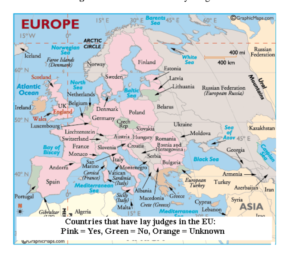
Figure 5. Countries With Lay Judges