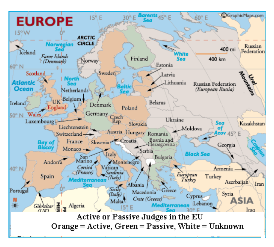
Figure 6. Countries With Active or Passive Judges