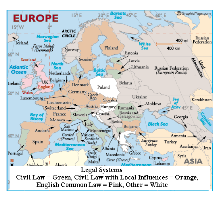
Figure 2. Legal System