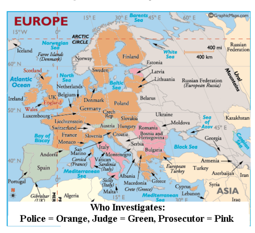
Figure 4. Who Investigates Crime