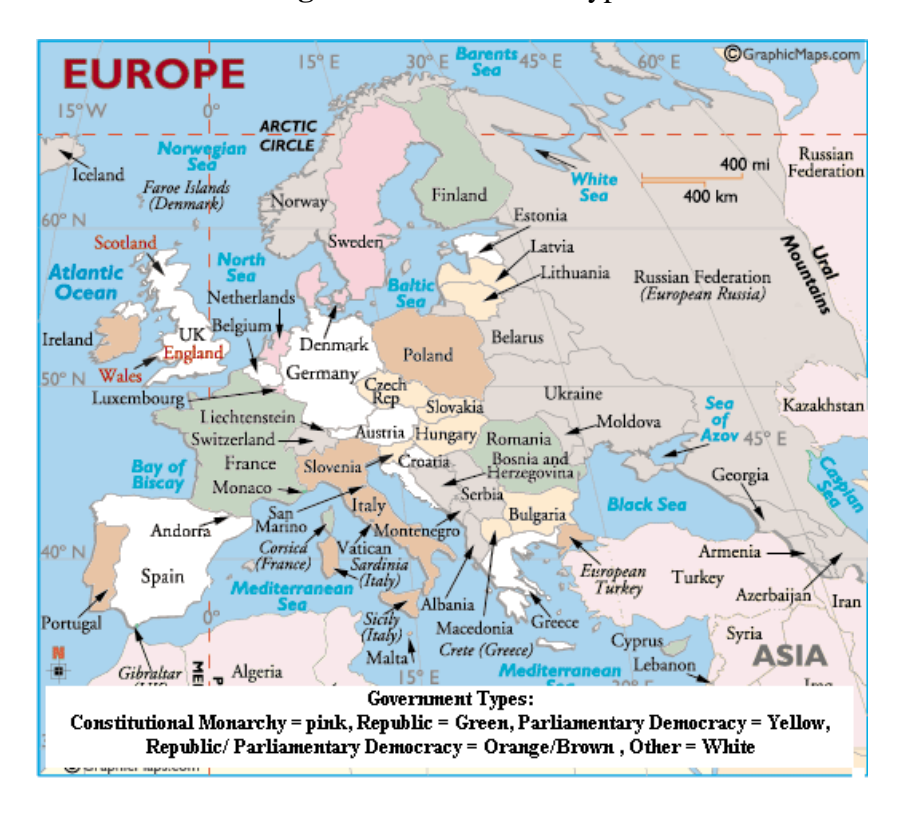
Figure 1. Government Type