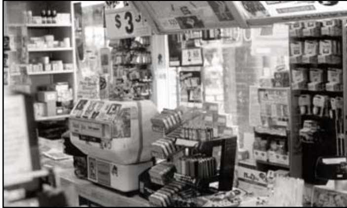
Cluttered merchandise displays make it harder for staff to monitor shoplifting.