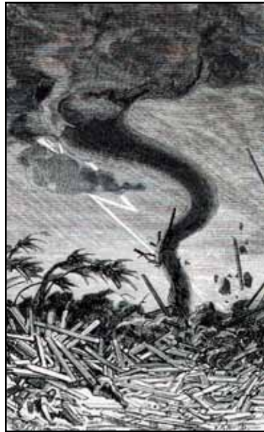
Tornado Over Land: "Histoire des Meteoires", J. Rambosson, 1869. Figure 48, p. 209. NWS Collection: Image Date: 1869

When the telegraph became operational in 1845, visionaries saw the possibility of forecasting storms by telegraphing what was coming. Joseph Henry, Secretary of the new Smithsonian Institution, envisioned opportunities of the communication system and proposed, "...a system of observation which shall extend as far as possible over the North American continent... The citizens of the United States are now scattered over every part of the southern and western portions of North America, and the extended lines of the telegraph will furnish a ready means of warning the more northern and eastern Observers to be on the watch for the first appearance of an advancing storm."