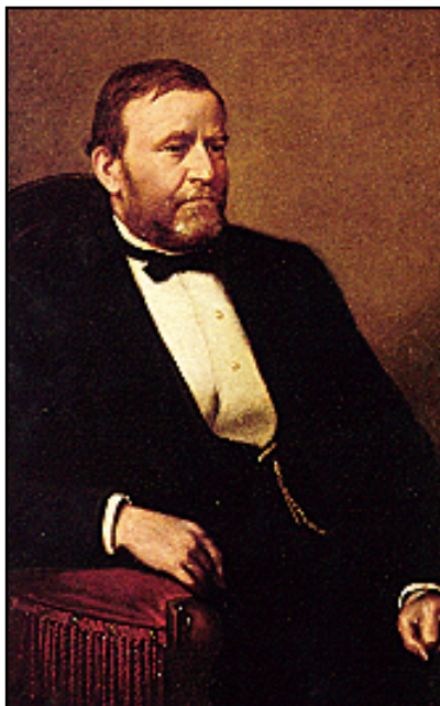
Ulysses S. Grant

Later that year, the first systematized, synchronous weather observations ever taken in the U.S. were made by "observing-sergeants" of the Army Signal Service at 22 stations and telegraphed to Washington. An agency was born that would affect the daily lives of most of the citizens of the United States through its forecasts and warnings. ✨