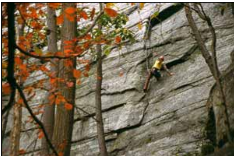
Climber amidst autumn foliage in the Mohonk Reserve, courtesy of mohonkreserve.org.

At Mohonk, average annual temperatures from 1896-2006 went up 2.63 degrees Fahrenheit. Global measurements in the same time over both land and oceans put the rise at about 1.2 to 1.4 degrees; but land temperatures are rising faster than those over the oceans, and those at Mohonk track the expected land trend closely. As