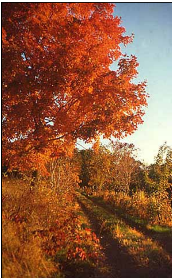
Autumn Trail in the Mohonk Reserve