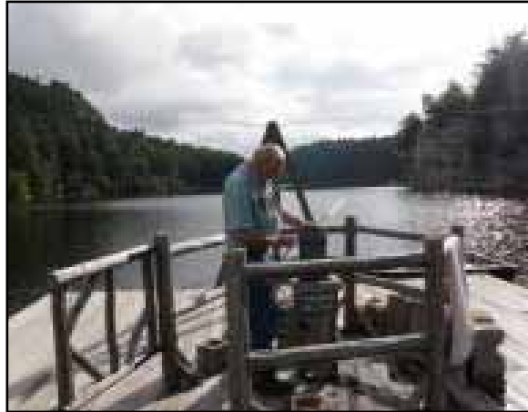
The rain gauge at Mohonk is the brass 1896 original, supplied by the US Weather Bureau, now the National Weather Service.