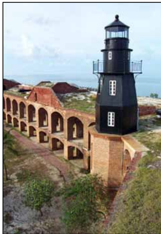
Lighthouse at Ft Jefferson National Park in the Florida Keys.