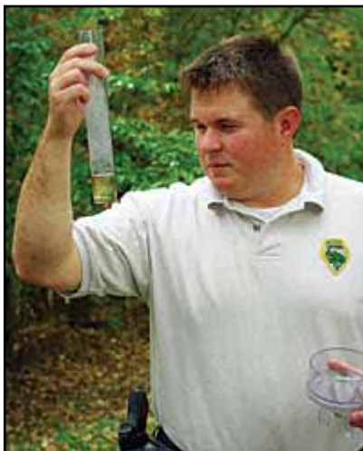
Park volunteer takes observation.

The CoCoRaHS program came to Tennessee in April 2007, just in time to document one of the worst droughts in recent history. Tennesseans lived up to their heritage as the "Volunteer State" by stepping up and developing one the largest and most active CoCoRaHS programs