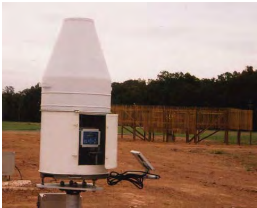
Fischer-Porter Rain Gauge

in the state is a site called Pa'akea on the island of Maui. The technicians who install the equipment are working to ensure the precipitation records are accurate, reliable and available for climatologists for years to come.