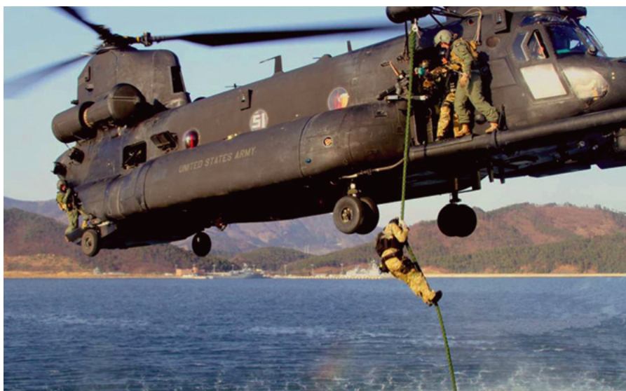
As part of Foal Eagle 2012, U.S. and ROK SEALs fast-rope off an MH-47 Chinook helicopter and perform a visit, board, search and seizure drill.

The Republic of Korea is a great place to soldier. The threat posed by North Korea requires United Nations Command, Combined Forces Command and U.S. Forces Korea to be well trained, well equipped and ready. The U.S.-ROK alliance is the strongest bilateral alliance in the world. Serving in Korea provides soldiers an opportunity to be part of this great alliance, to be well trained on their wartime tasks across the full spectrum of conflict, and to learn about the Korean people and their culture. I look forward to seeing you over here. ★