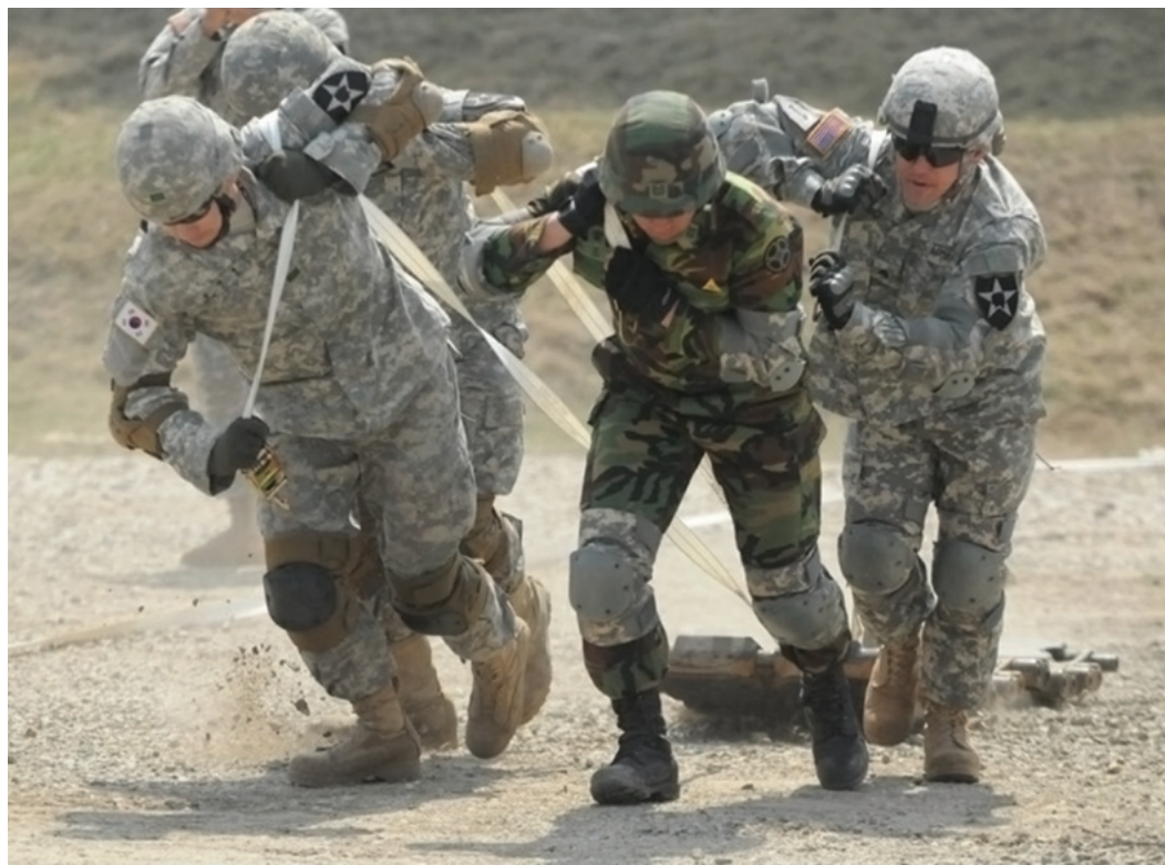
A combined team of ROK and U.S. Army soldiers and Korean Augmentees to the U.S. Army compete during an event at Rodriguez Live Fire Complex near Pocheon, South Korea.

United Nations Command, Combined Forces Command and U.S. Forces Korea, along with ROK and multinational forces, execute two major theater-combined exercises every year: Key Resolve and Ulchi Freedom Guardian. In addition, subordinate units execute combined training at all levels from platoon to battalion with their ROK partners. These exercises increase our interoperability and continue to build the mutual trust that makes our alliance the strongest in the world. They also provide the opportunity to validate the alliance's war plans and identify areas for further refinement. Furthermore, the command utilizes our exercise program to further develop whole-of-government approaches to meeting current and future security challenges. Leaders at all levels conduct frequent engagements with their ROK counterparts. The long history and great strength of this alliance enable U.S. and ROK leaders to have open, frank discussions about issues pertaining to our respective nations and the alliance. These leader actions coupled with our robust exercise program provide the opportunity for our alliance to continue being best prepared to meet the security challenges of the future.