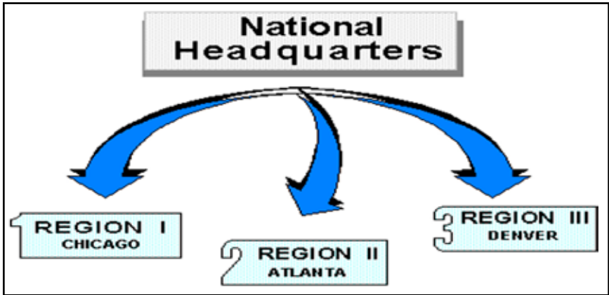
Figure 1 - Agency Structure

The current structure of the Selective Service System also includes three Region Headquarters. The National Headquarters and Region Headquarters make up the contingency of full-time employees of Selective Service. See Figure 1 below.