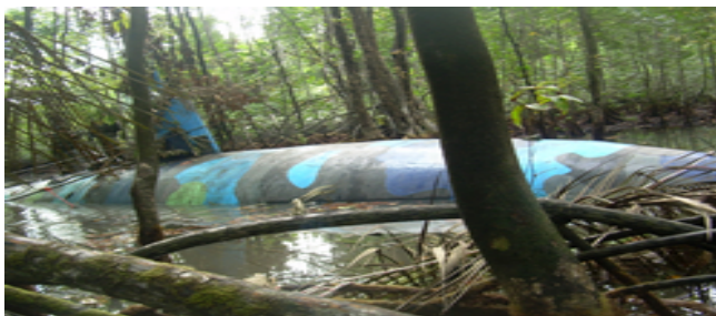
This submarine, seized by Ecuadorean soldiers near the Colombian border, is believed to be capable of long-range underwater voyages to transport narcotics to the United States. (Photo courtesy of U.S. Drug Enforcement Agency).

Interdicting Self Propelled Fully Submersibles (SPFSs). The Operations Law Group is currently working with law enforcement counterparts to analyze authority to take law enforcement action against SPFSs. The issue is focused on international standards for communication and use of force as well as domestic authorities that enable use of force in the Coast Guard law enforcement mission areas.