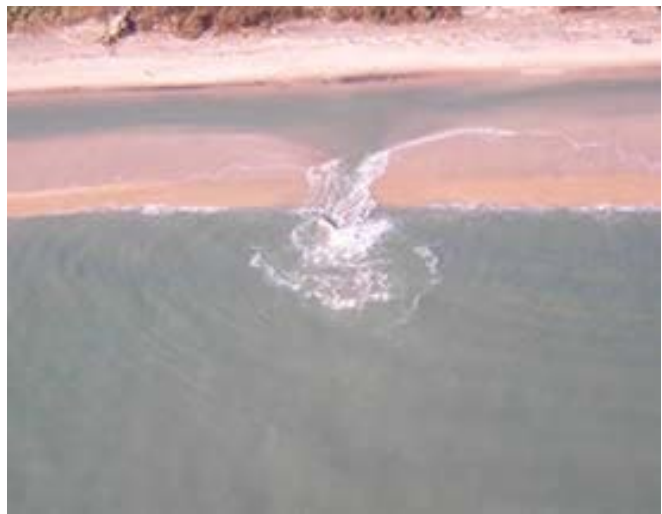
Rip Current in Florida after Hurricane Jeanne.

The June press conference was carried by Cable News Network (CNN) and Fox Network, with coverage provided by the Associated Press and USA Today.