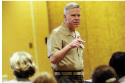
Note photograph: General Assistant Commandant of the Marine Corps Gen. James Amos speaks during the first DON SARC Summit March 22, 2010, in New Orleans, LA.