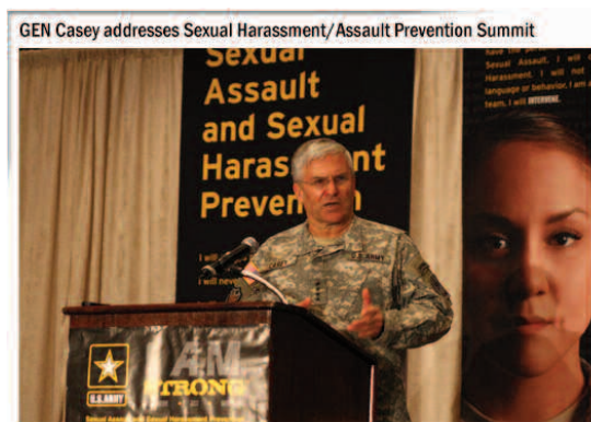
Note photograph: Army Chief of Staff George W. Casey Jr. speaks on the importance of preventing sexual harassment and assault during the 2010 Sexual Harassment/Assault Prevention Summit in Arlington, VA, March 30, 2010.