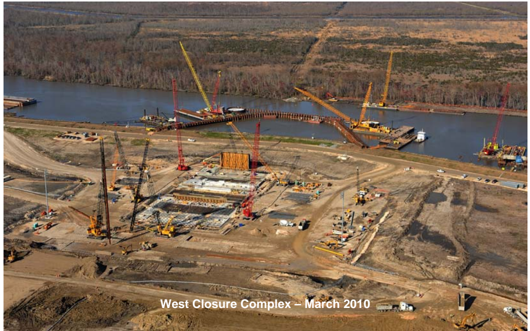
West Closure Complex – March 2010

The West Closure Complex is a major feature of the 100-year System that the Corps of Engineers is de-