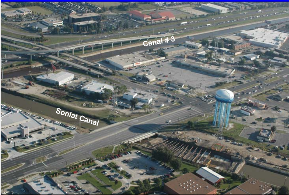
This October photo shows the SELA project at Soniat Canal from Veterans' Memorial Blvd. to Canal #3.