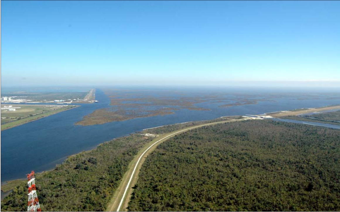
Looking east, this aerial photo shows the confluence of the GIWW (left) and MRGO (right) with Lake Borgne in the background. This is one of the anticipated locations of the IHNC 100-year barrier structure.

for interim protection for the area could have adversely affected the construction timeline and the physical ability of constructing the permanent solution because of the location of the structures and all the requirements inherent in the process.”