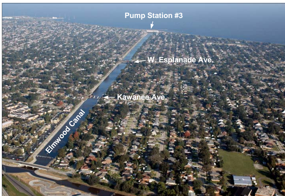
The SELA program enlarged and added concrete lining to the entire length of the Elmwood Canal, and recently completed improvements to Pump Station #3. SELA projects also include the bridges at Kawanee Ave. and W. Esplanade Ave.

President committed to asking Congress for $1.3 Billion for SELA in FY09 Budget