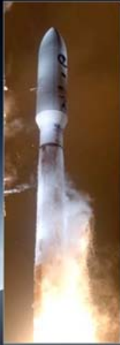
L-41 20 SEP 2010 Atlas V Vandenberg