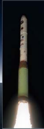
L-66 6 FEB 2011 Minotaur I Vandenberg