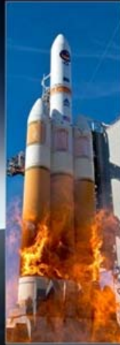
L-49 20 JAN 2011 Delta IV Heavy Vandenberg