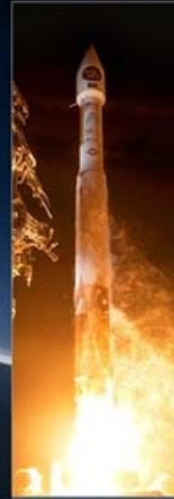
L-34 14 APR 2011 Atlas V Vandenberg