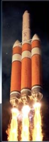
L-32 21 NOV 2010 Delta IV Heavy Cape