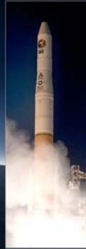
L-27 11 MAR 2011 Delta IV Cape