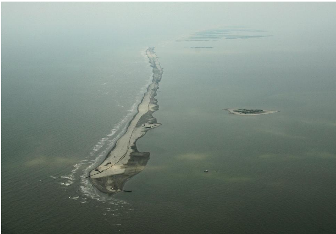
E4 North Berm – August 26, 2010

Shaw Environmental & Infrastructure Group