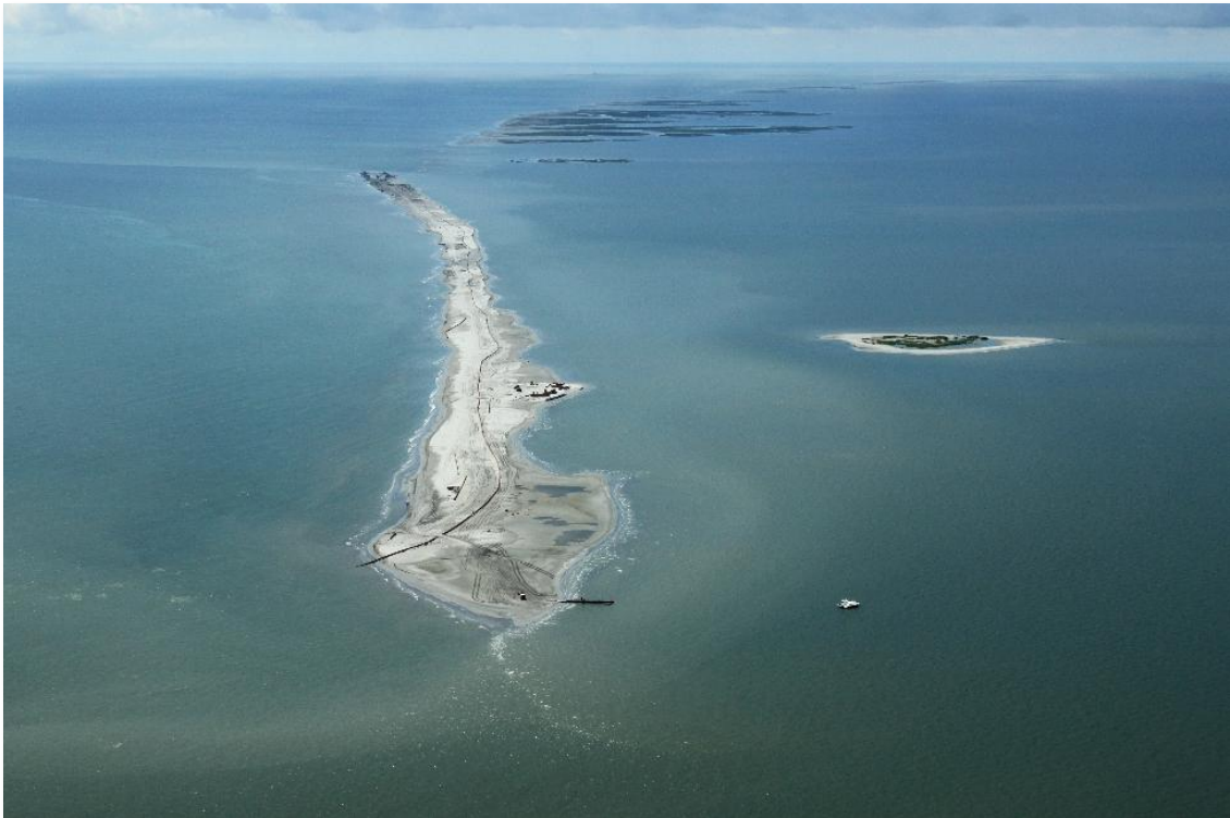
E4 North Berm – August 22, 2010

Shaw Environmental & Infrastructure Group