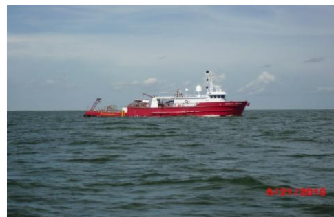
Geodetic Surveyor at 25-5 – August 21, 2010