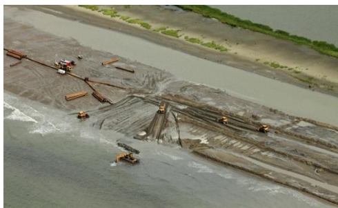
W9 Berm – August 20, 2010

*Under Construction represents linear footage of berm placed; all material may not yet conform to elevation +6.