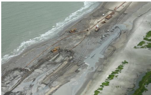
W9 Berm – August 15, 2010

*Under Construction represents linear footage of berm placed; all material may not yet conform to elevation +6.