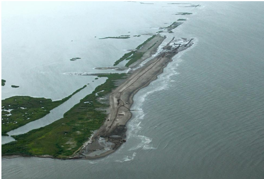
W9 Berm – August 15, 2010

Prepared by: Shaw Environmental & Infrastructure Group