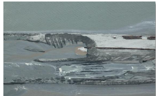
E4 North Berm – August 15, 2010