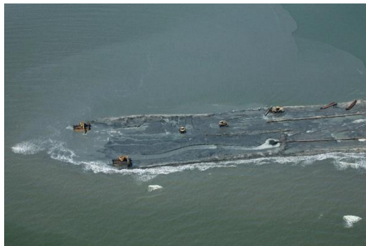
E4 Berm Construction – August 10, 2010

*Under Construction represents linear footage of berm placed; all material may not yet conform to elevation +6.