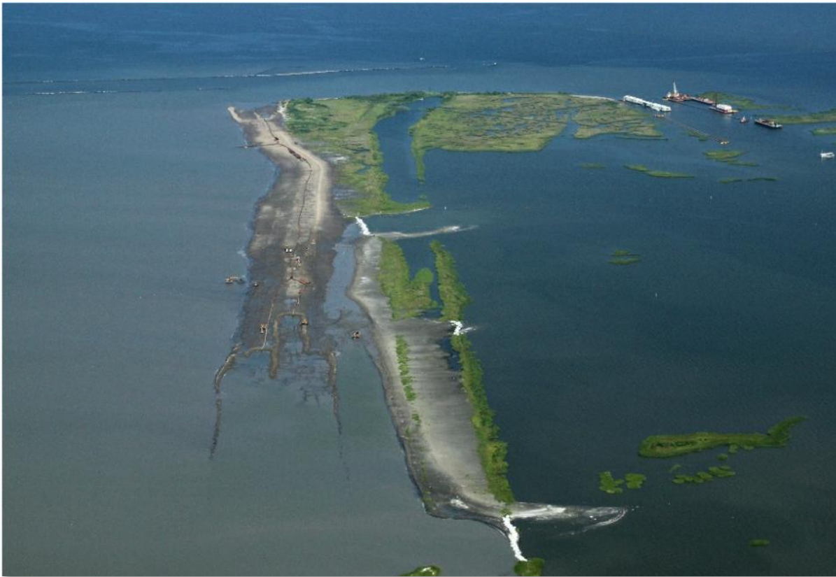
W9 Berm – August 10, 2010

Shaw Environmental & Infrastructure Group