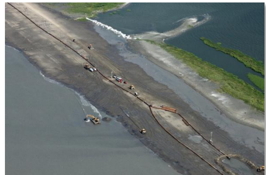
W9 Berm – August 10, 2010