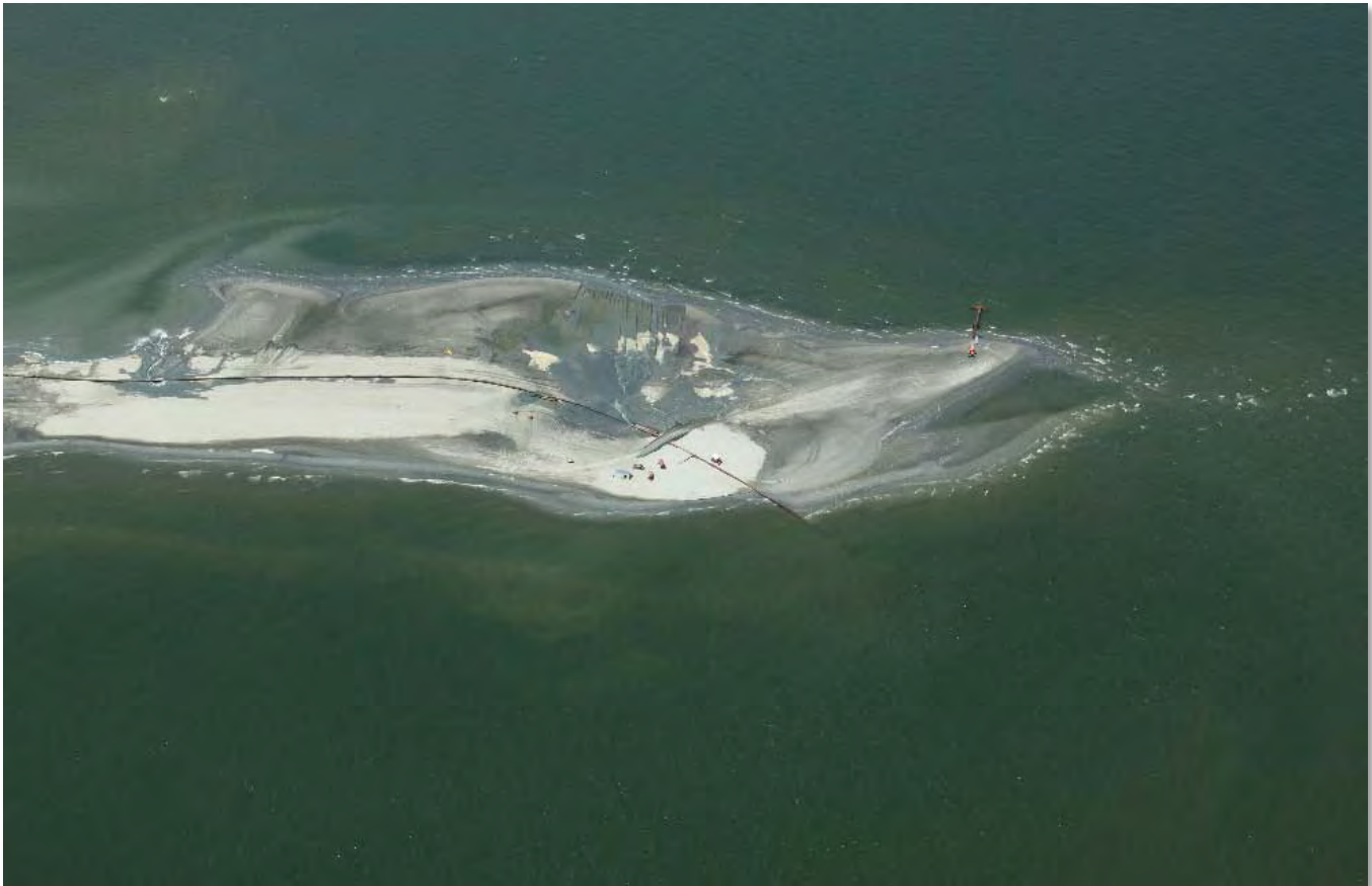
E4 North Berm – August 8, 2010

Shaw Environmental & Infrastructure Group