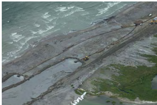
W9 Berm Construction – August 5, 2010

Note: Percent complete of material handled represents only 1 of 3 elements of percent complete for the overall project.