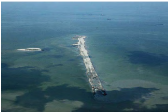
E4 Berm – August 5, 2010