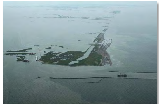
W9 Berm – August 5, 2010