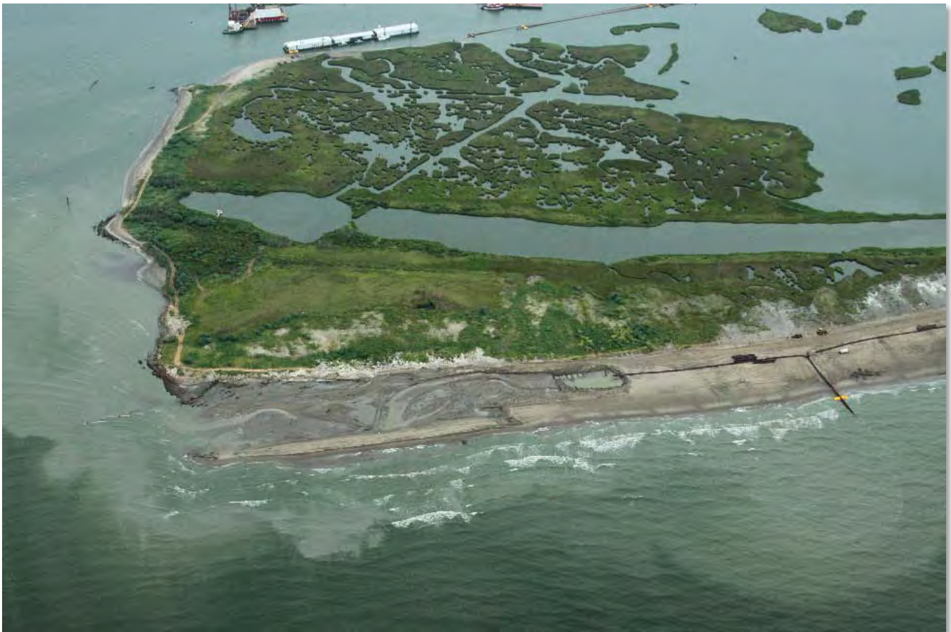
W9 Berm (Pelican Island) – August 5, 2010

Shaw Environmental & Infrastructure Group