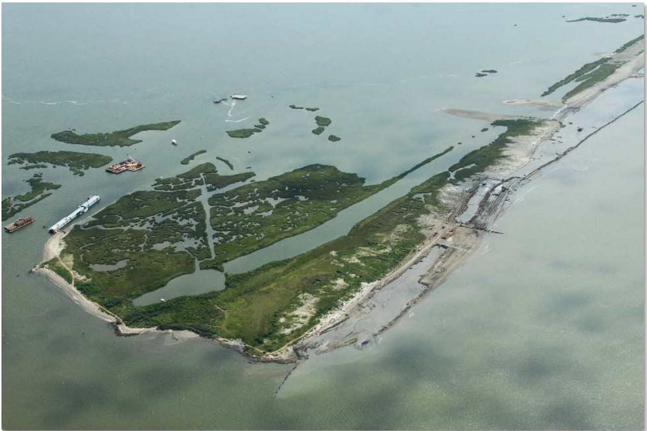
W9 Berm Operations – August 1, 2010

Shaw Environmental & Infrastructure Group