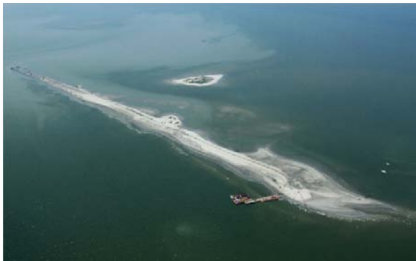
E4 Berm – August 1, 2010