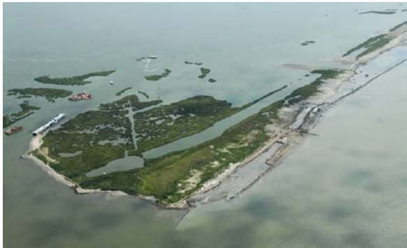
W9 Berm – August 1, 2010

Note: Percent complete of material handled represents only 1 of 3 elements of percent complete for the overall project.