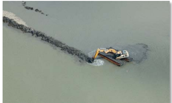
W9 Berm Construction – August 1, 2010