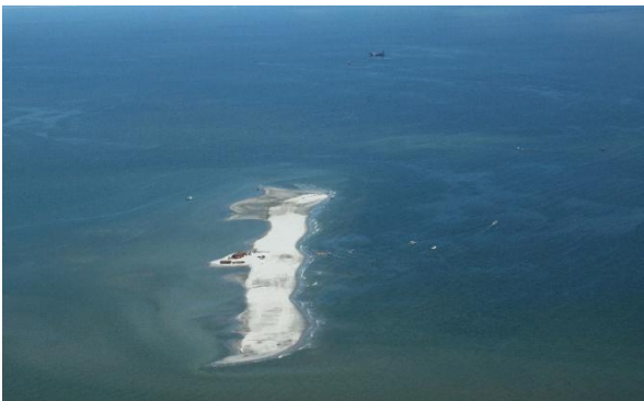
E4 Berm Aerial Photo - July 27, 2010