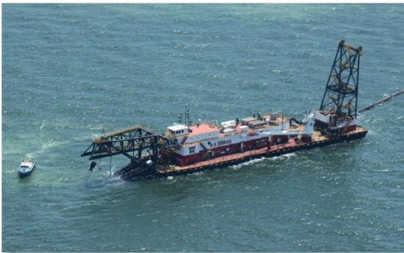
RS Weeks cutter dredge - July 22, 2010

Note: Percent complete of material handled represents only 1 of 3 elements of percent complete for the overall project.