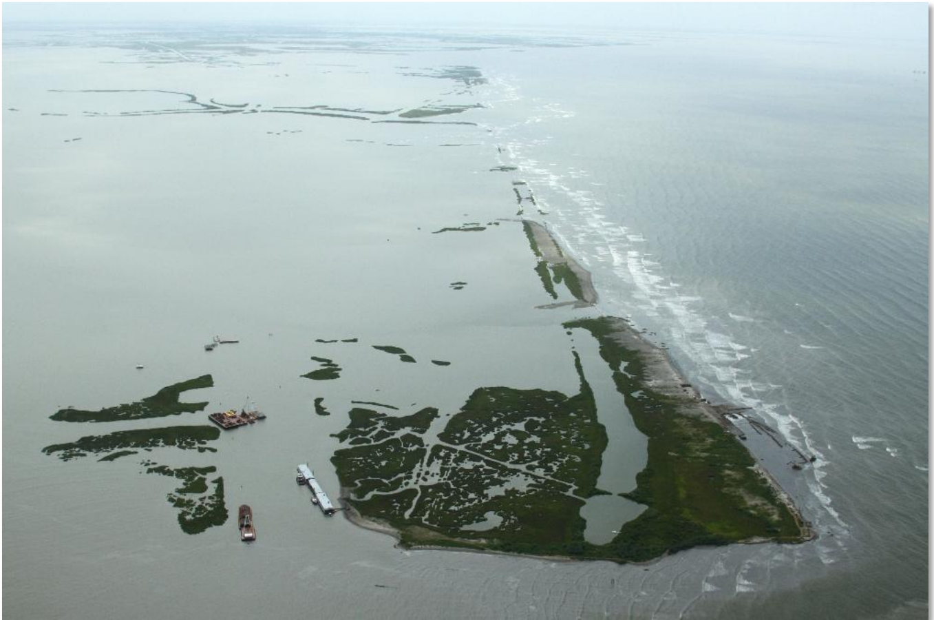
W9 Berm – July 27 th , 2010

Prepared by: Shaw Environmental & Infrastructure Group