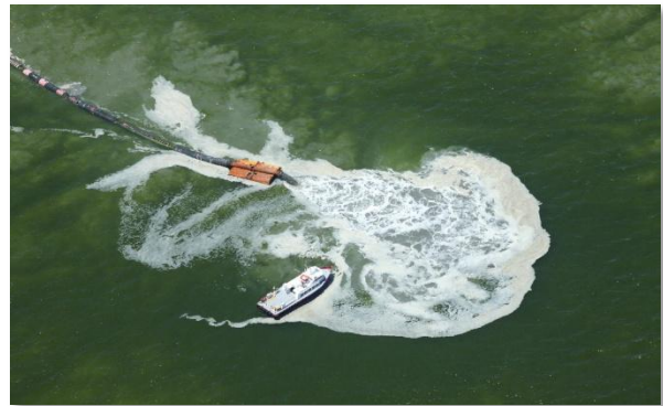
E4 Berm 6A refill – July 27, 2010