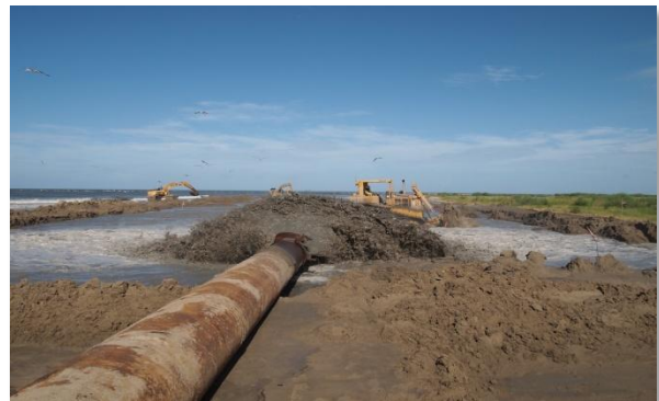
W9 Berm Construction – July 27, 2010