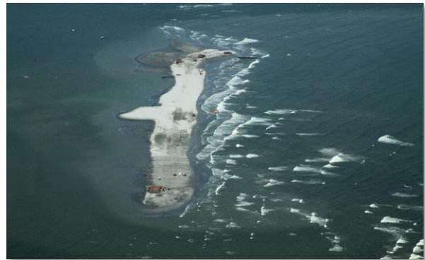
E4 Aerial Photo – July 22, 2010