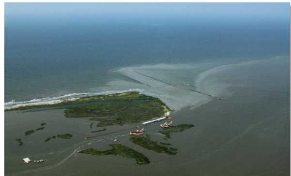
W9 Aerial Photo – July 22, 2010