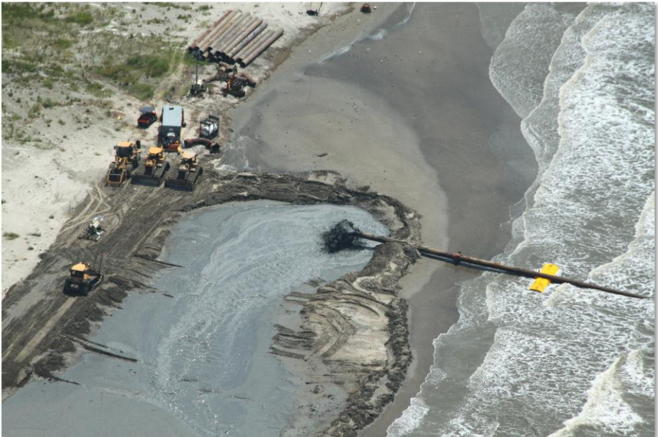
W9 Berm Construction – July 22 nd , 2010

Shaw Environmental & Infrastructure Group