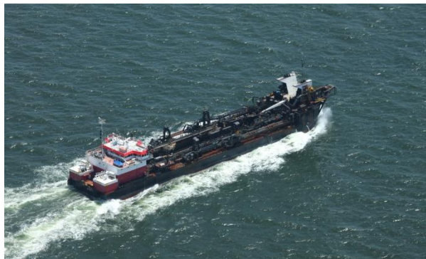
RN Weeks hopper dredge - July 22, 2010