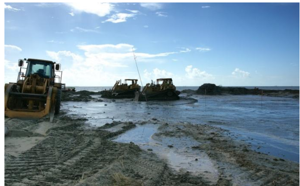
W9 Berm Operations – July 20, 2010