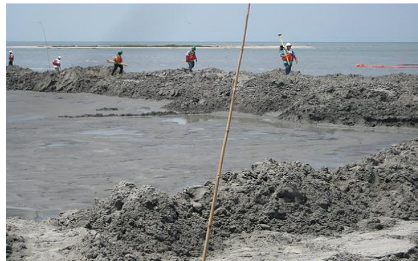
Berm E4 – July 15, 2010