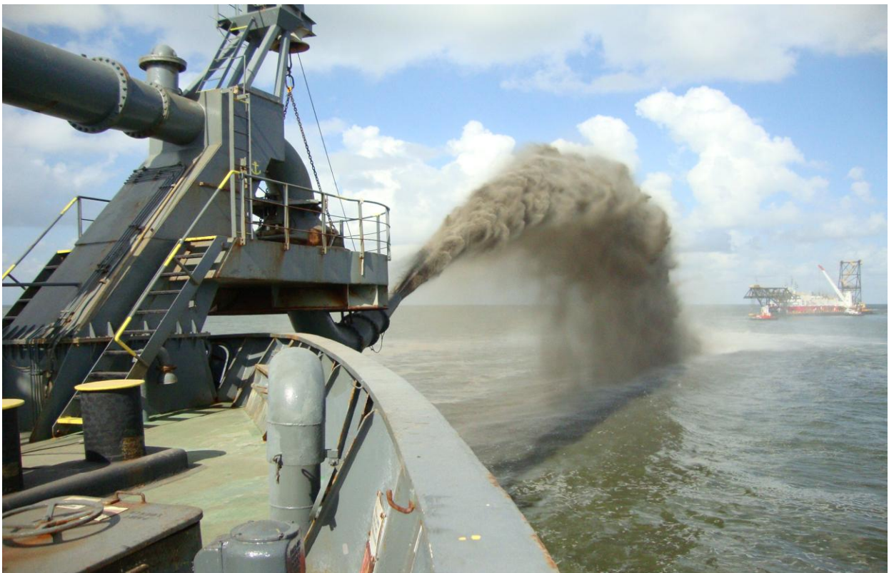
Stuyvesant hopper dredge – July 20, 2010

Prepared by: Shaw Environmental & Infrastructure Group