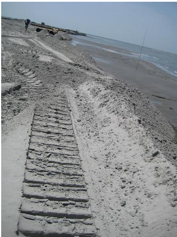
On Berm Reach E4 – July 15, 2010

Note: Percent complete of material handled represents only 1 of 3 elements of percent complete for the overall project.