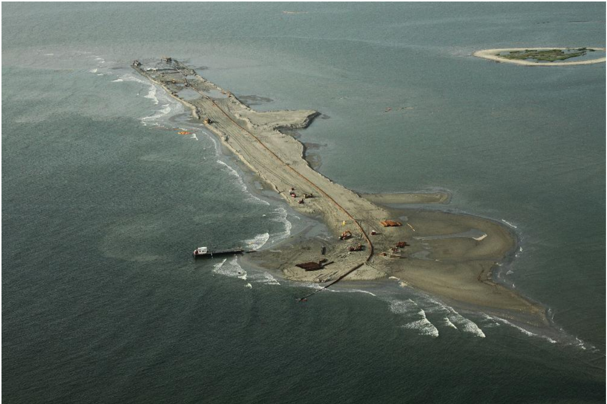
E4 Berm – July 19, 2010

Shaw Environmental & Infrastructure Group