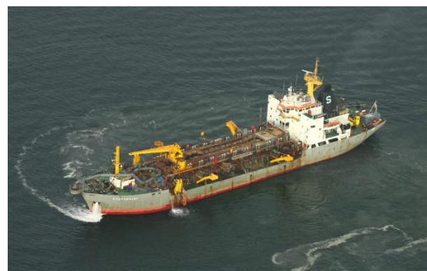
Stuyvesant hopper dredge – July 19, 2010