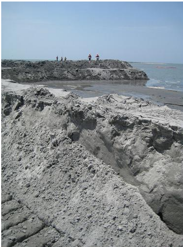
On Berm Reach E4 – July 15, 2010

Note: Percent complete of material handled represents only 1 of 3 elements of percent complete for the overall project.