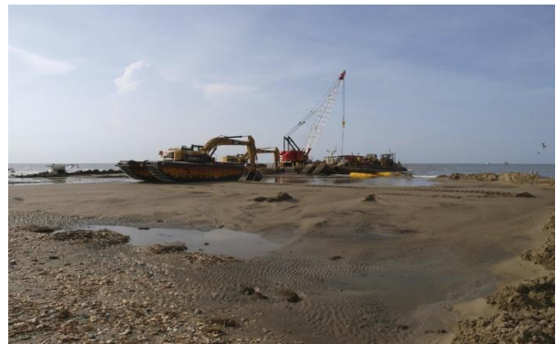
W9 Berm Operations – July 19, 2010