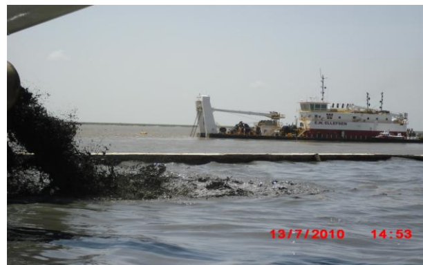
Spider loading scow – July 15 th