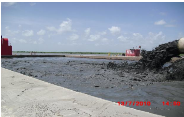
Spider loading scow – July 15 th

Note: Percent complete of material handled represents only 1 of 3 elements of percent complete for the overall project.