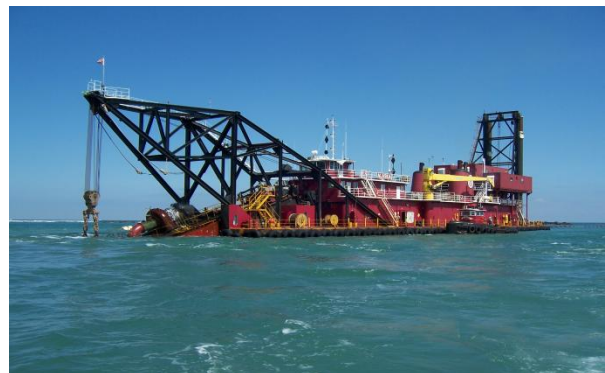
Alaska cutter dredge – July 16 th