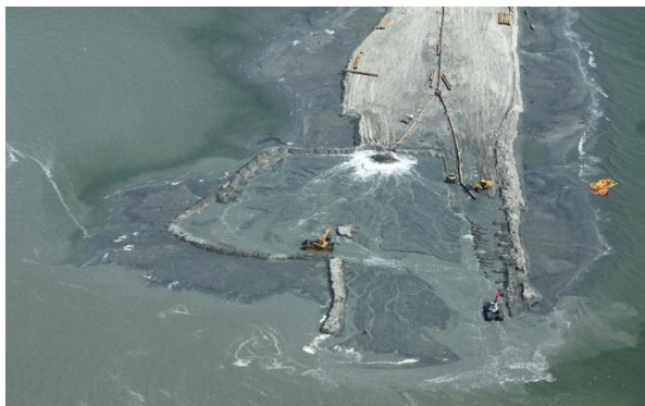
E4 Berm Construction – July 13 th