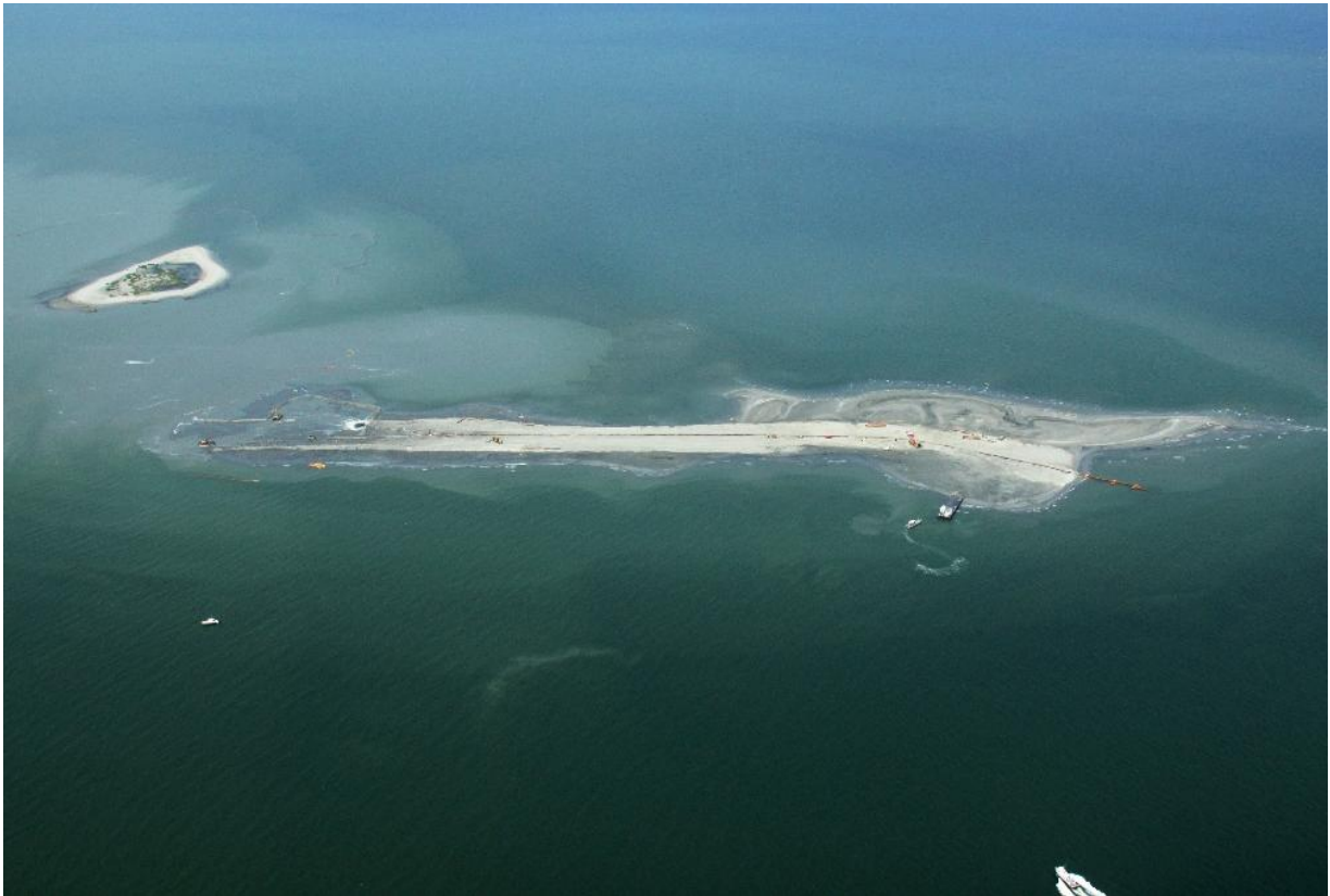
E4 Berm – July 15, 2010

Prepared by: Shaw's Environmental & Infrastructure Group