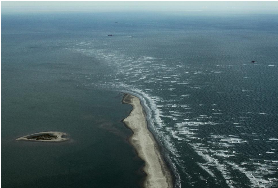
E4 North Berm – November 28, 2010

Shaw Environmental & Infrastructure Group