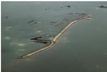
W8 Berm – November 28, 2010

Note: Under Construction represents linear footage of berm placed; all material may not yet conform to elevation +6.