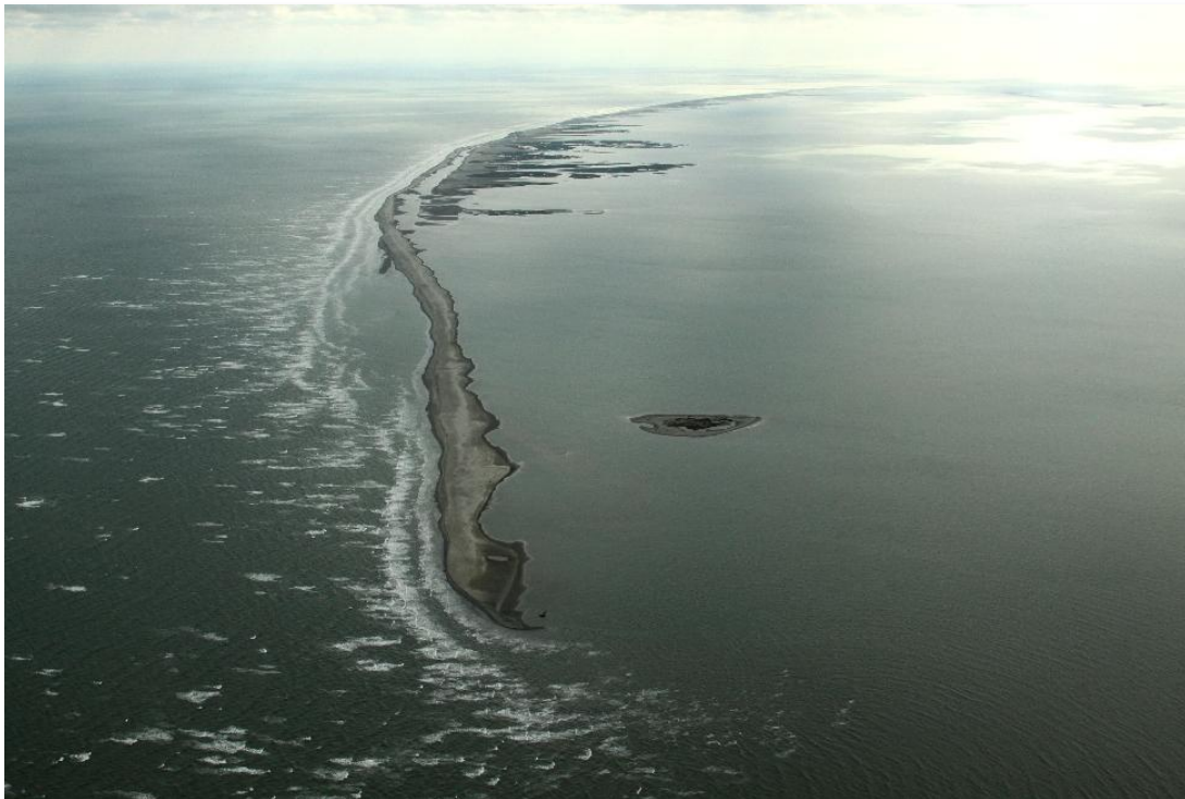
E4 North Berm – November 28, 2010

Prepared by: Shaw Environmental & Infrastructure Group