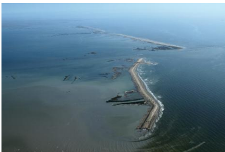
W8 Berm – November 23, 2010

Note: Under Construction represents linear footage of berm placed; all material may not yet conform to elevation +6.