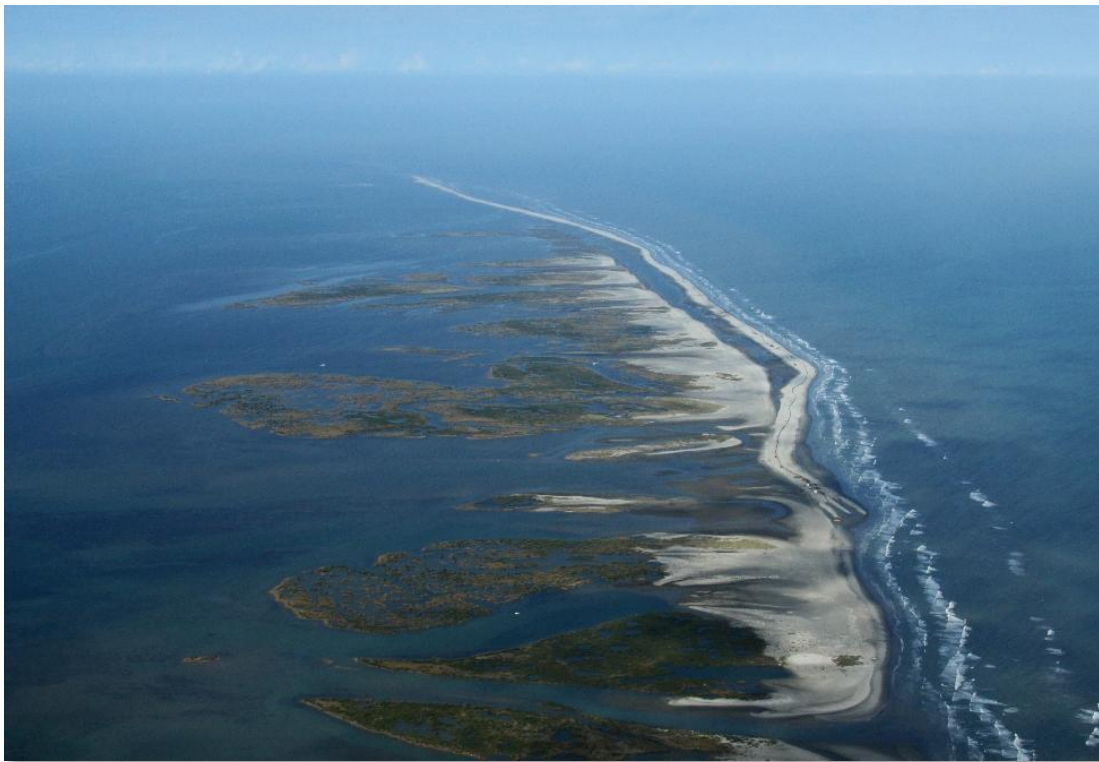
E4 North Berm – November 23, 2010

Shaw Environmental & Infrastructure Group