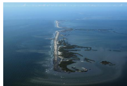
W9, & W10 Berms – November 23, 2010