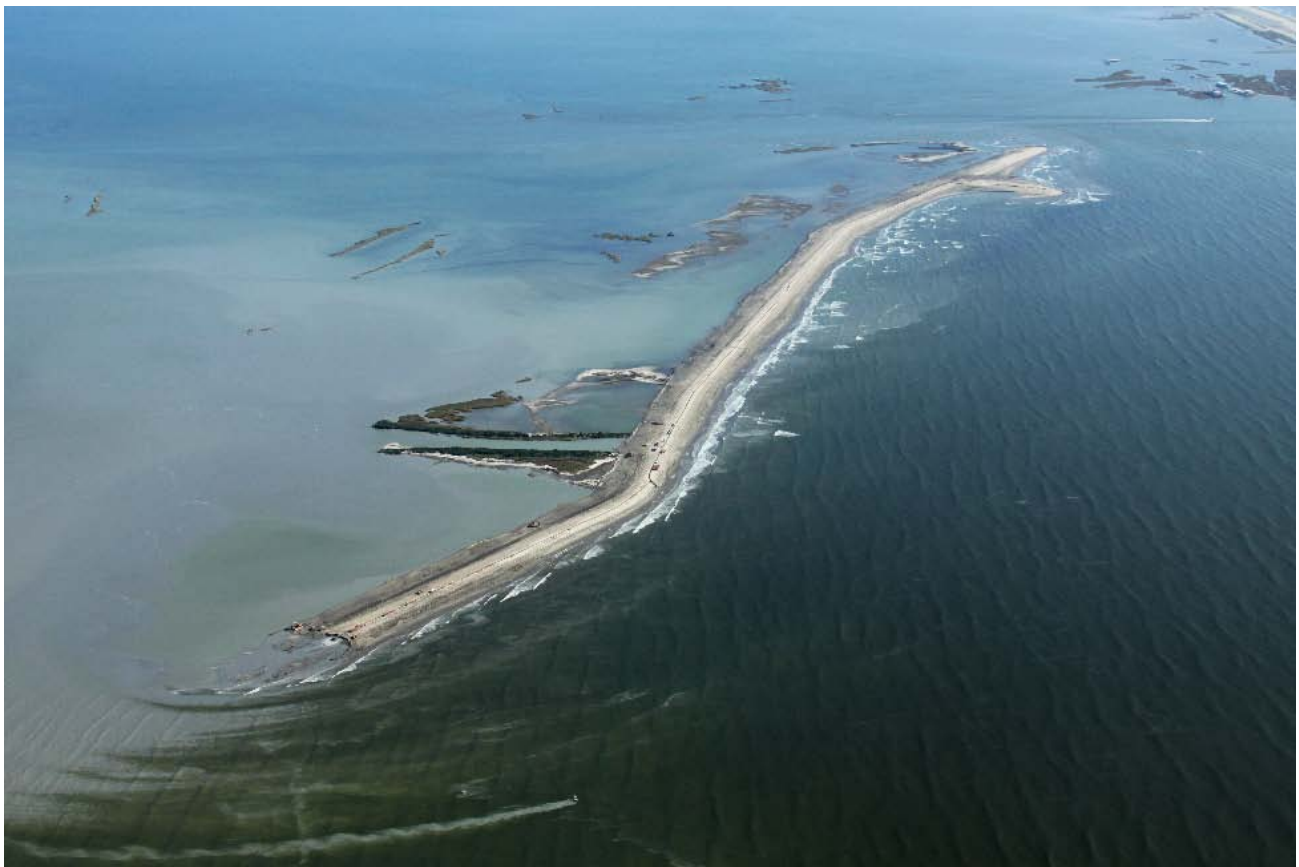
W8 Berm Operations – November 23, 2010

Shaw Environmental & Infrastructure Group