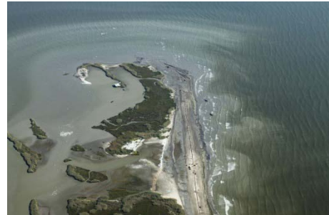
W10 Berm Operations – November 23, 2010