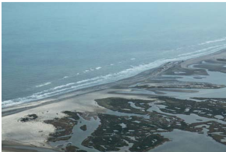
E4 Berm Operations – November 23, 2010

Note: Under Construction represents linear footage of berm placed; all material may not yet conform to elevation +6.