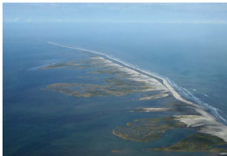
E4 Berm Operations – November 23, 2010

Note: Under Construction represents linear footage of berm placed; all material may not yet conform to elevation +6.