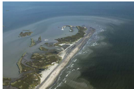
W10 Berm Operations – November 23, 2010