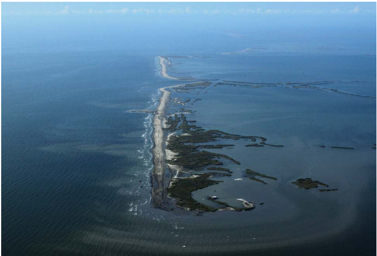
West Berm Operations – November 23, 2010

Shaw Environmental & Infrastructure Group