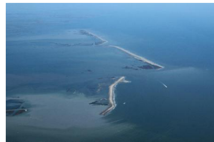
W8, W9, & W10 Berms – November 21, 2010