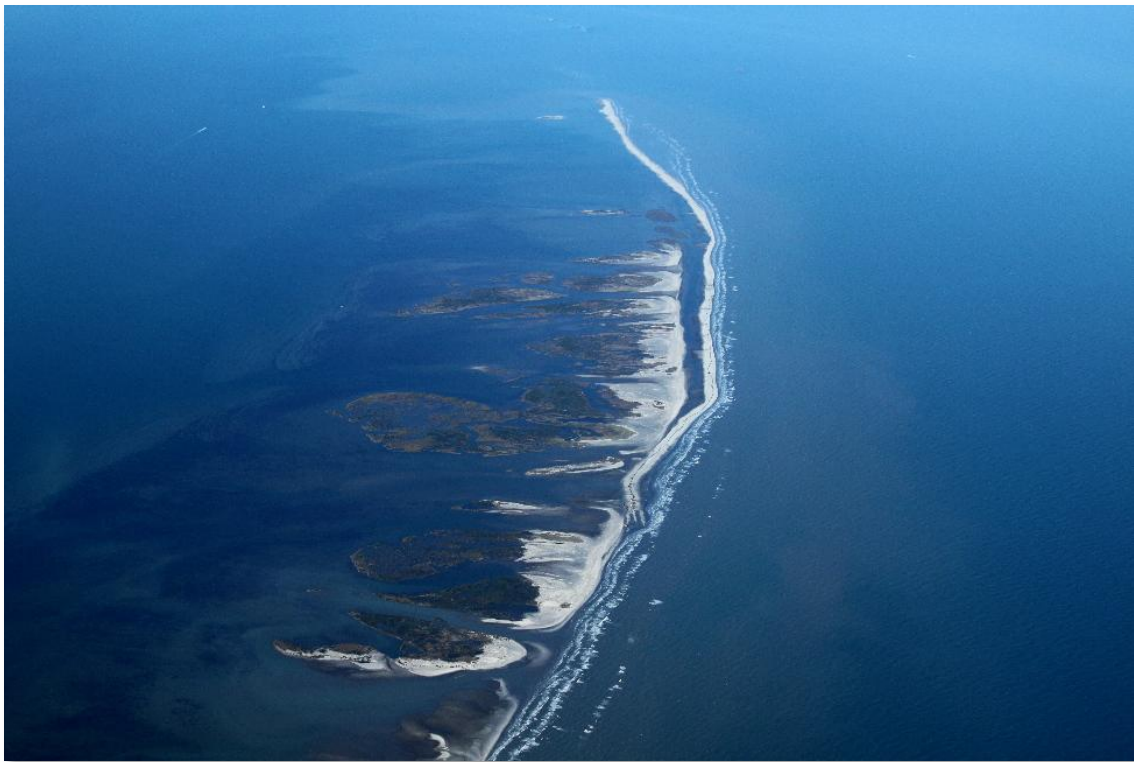
E4 North Berm – November 21, 2010

Prepared by: Shaw Environmental & Infrastructure Group