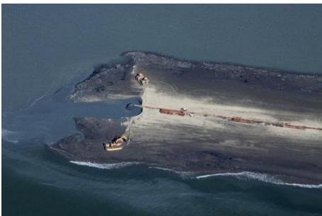
W8 Berm Operations – November 21, 2010

Note: Under Construction represents linear footage of berm placed; all material may not yet conform to elevation +6.