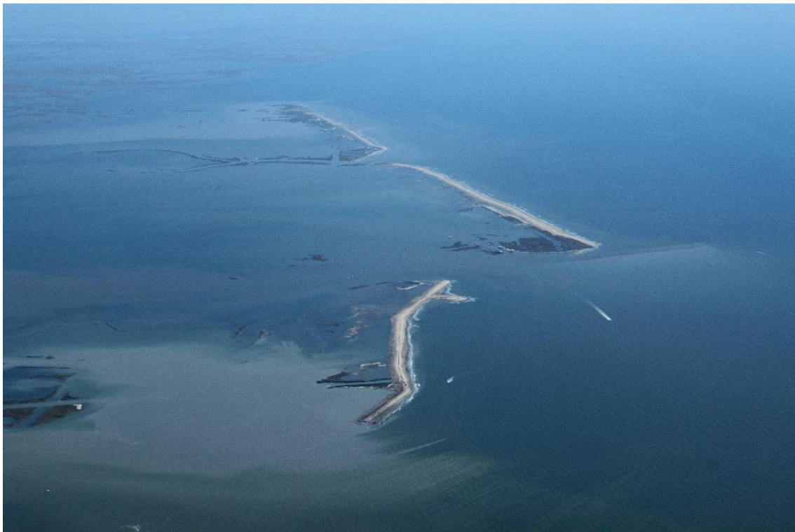
W8, W9, & W10 Berms – November 21, 2010

Shaw Environmental & Infrastructure Group