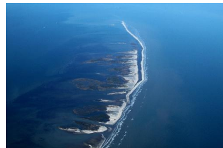
E4 North Berm – November 21, 2010