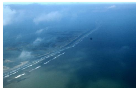
E4 North Berm – November 16, 2010