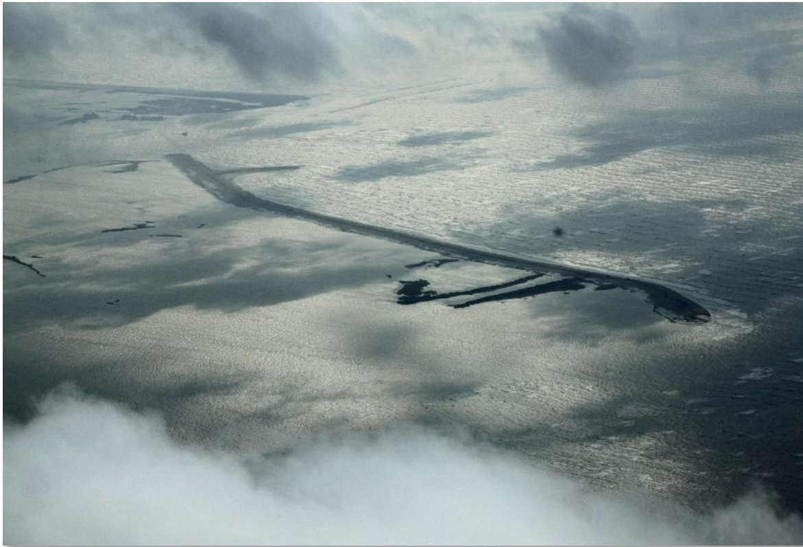
W8 Berm – November 16, 2010

Shaw Environmental & Infrastructure Group