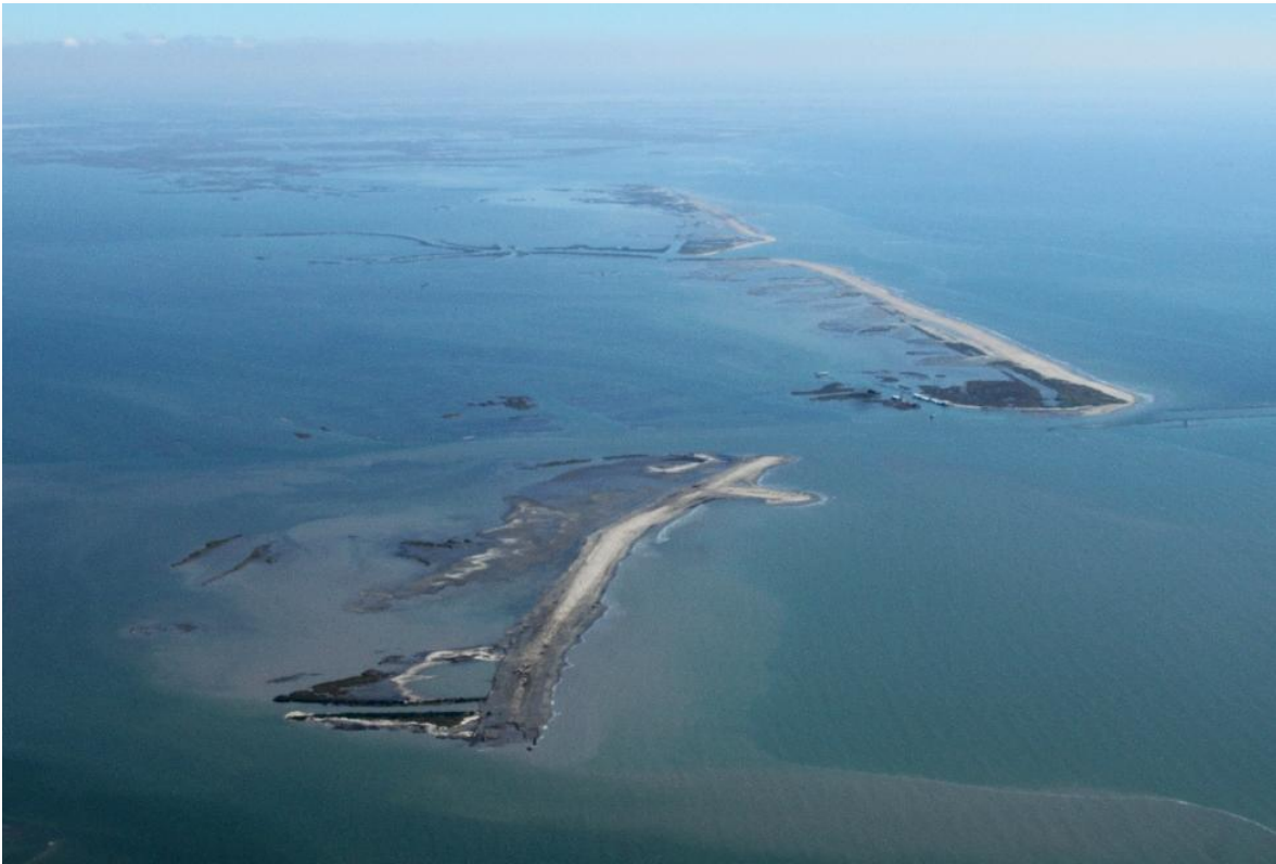
W8, W9, & W10 – November 10, 2010

Shaw Environmental & Infrastructure Group