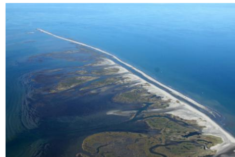
E4 North Berm – November 10, 2010