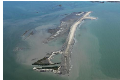
W8 Berm – November 10, 2010