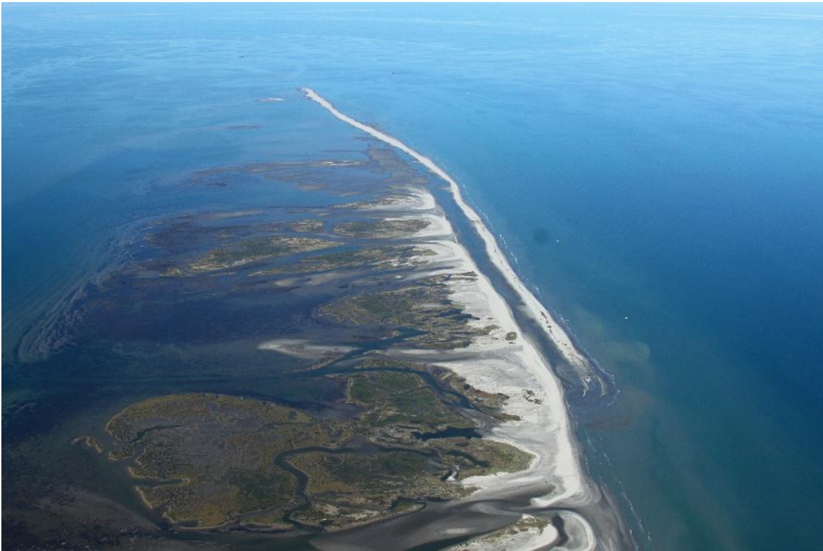
E4 North Berm – November 10, 2010

Prepared by: Shaw Environmental & Infrastructure Group