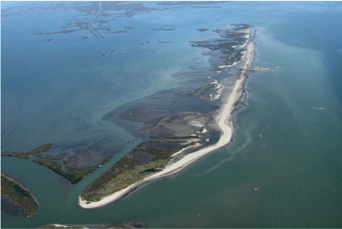
W10 Berm – November 10, 2010

Shaw Environmental & Infrastructure Group