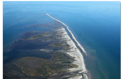
W8 Berm – November 10, 2010