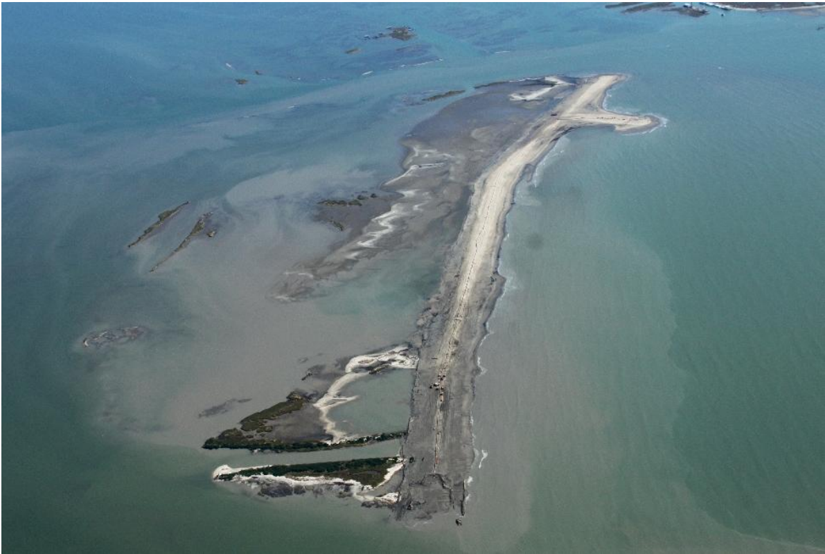
W8 Berm – November 10, 2010

Prepared by: Shaw Environmental & Infrastructure Group