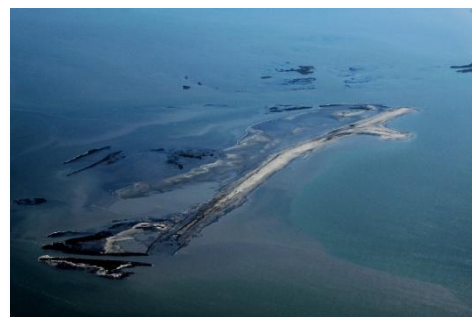
W8 Berm – November 7, 2010