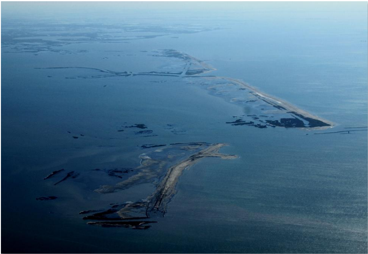
W8, W9, & W10 Berms – November 7, 2010

Shaw Environmental & Infrastructure Group