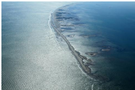
E4 North Berm – November 7, 2010

Note: Under Construction represents linear footage of berm placed; all material may not yet conform to elevation +6.