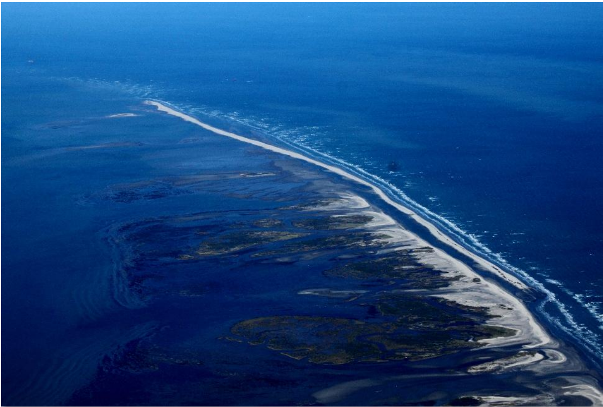
E4 North Berm – November 7, 2010

Shaw Environmental & Infrastructure Group