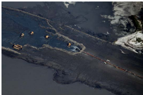
W10 Berm Operations – November 7, 2010

Note: Under Construction represents linear footage of berm placed; all material may not yet conform to elevation +6.