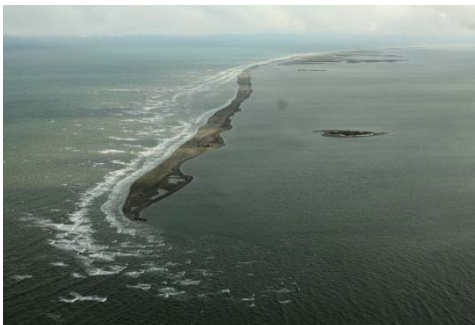
E4 Berm – November 3, 2010

Note: Under Construction represents linear footage of berm placed; all material may not yet conform to elevation +6.