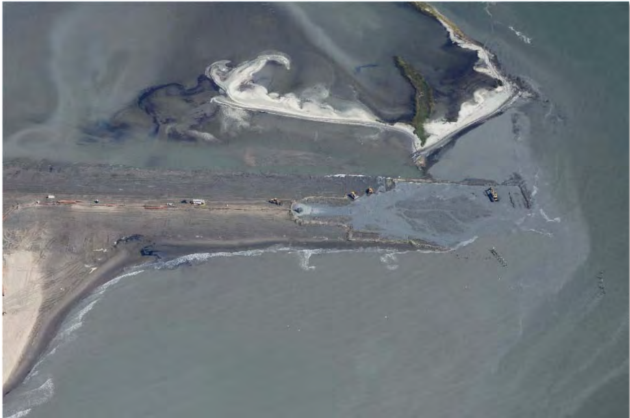
Eastern end of W8 Berm – October 31, 2010

Shaw Environmental & Infrastructure Group