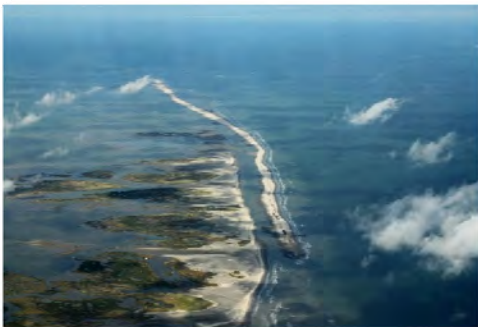
E4 Berm – October 31, 2010

Note: Under Construction represents linear footage of berm placed; all material may not yet conform to elevation +6.