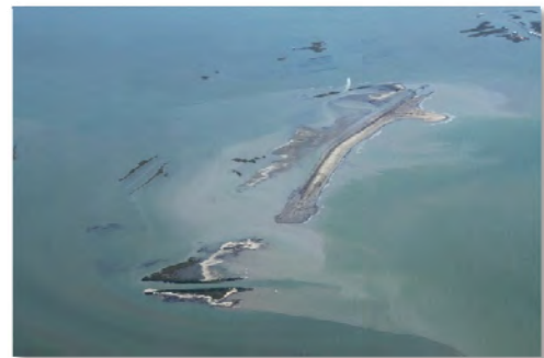
W8 Berm – October 31, 2010