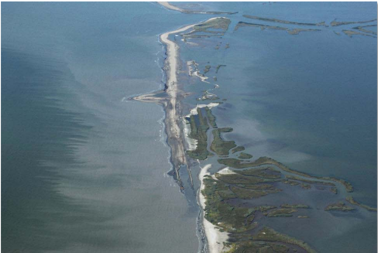
W10 North Berm – October 31, 2010

Shaw Environmental & Infrastructure Group