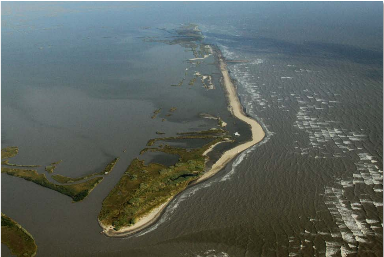
W10 Berm – October 26, 2010

Shaw Environmental & Infrastructure Group