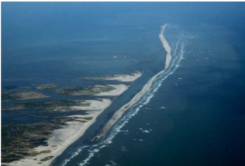
E4 Berm – October 24, 2010

Note: Under Construction represents linear footage of berm placed; all material may not yet conform to elevation +6.