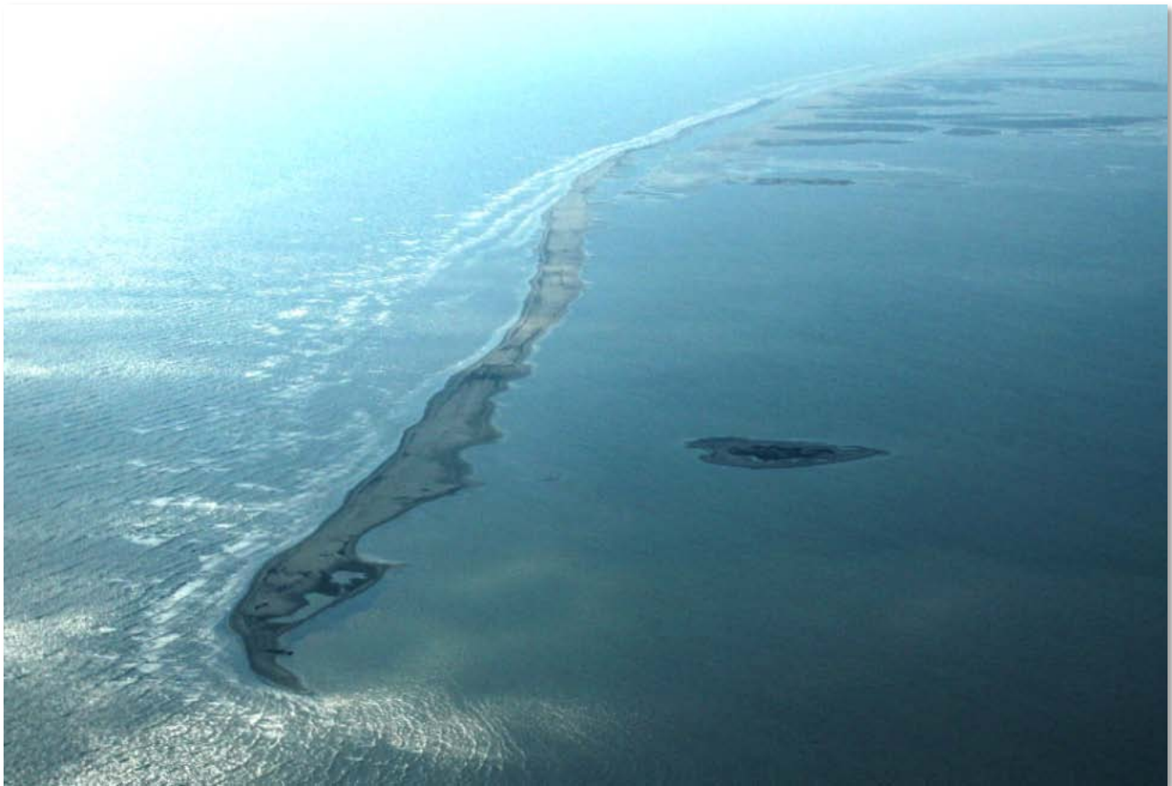
E4 North Berm – October 24, 2010

Shaw Environmental & Infrastructure Group