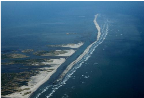
E4 Berm – October 24, 2010

Note: Under Construction represents linear footage of berm placed; all material may not yet conform to elevation +6.