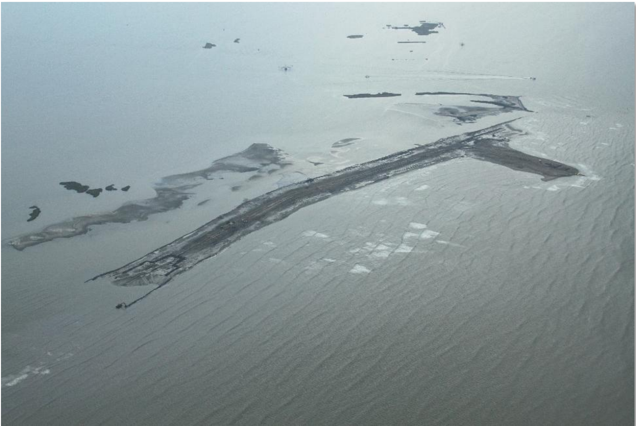
W8 Berm – October 24, 2010

Shaw Environmental & Infrastructure Group