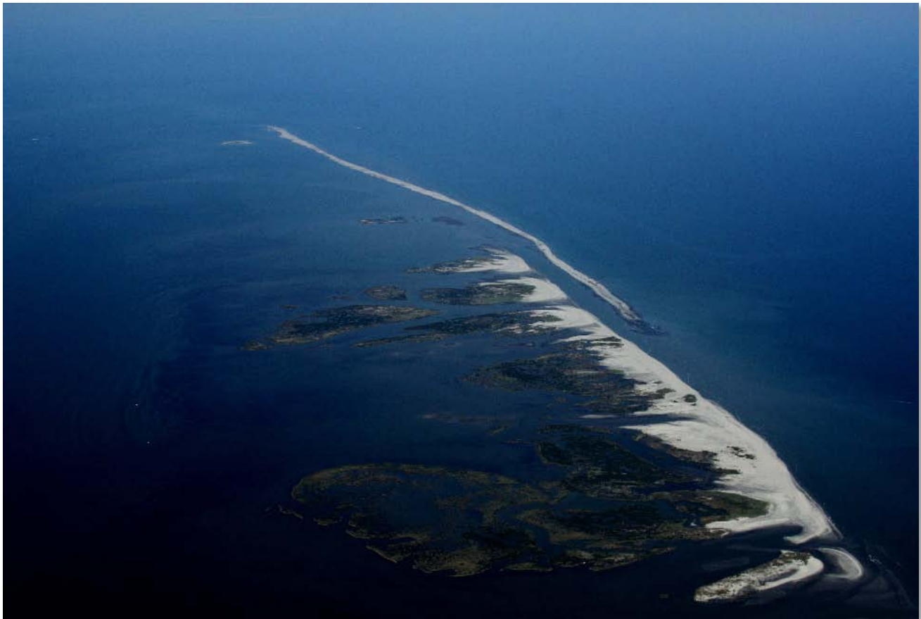
E4 Berm – October 19, 2010

Shaw Environmental & Infrastructure Group