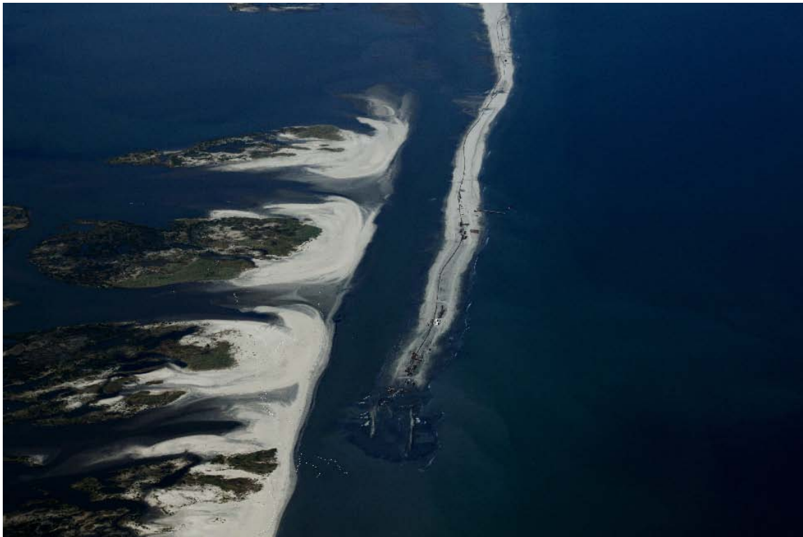
E4 Berm – October 19, 2010

Shaw Environmental & Infrastructure Group