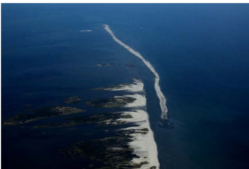
E4 Berm – October 19, 2010

Note: Under Construction represents linear footage of berm placed; all material may not yet conform to elevation +6.