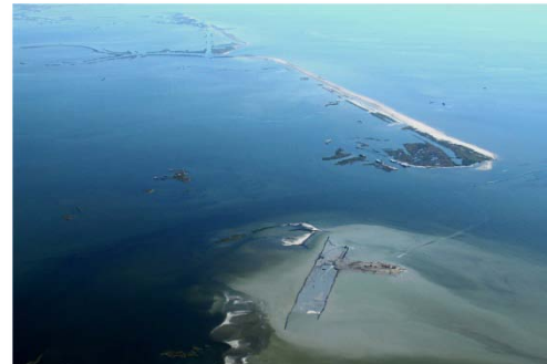
W8 & W9 Berm Operations – October 19, 2010